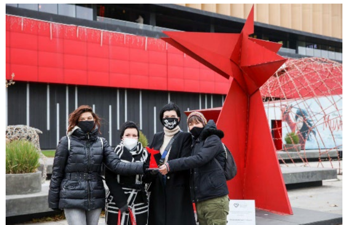
Members of the group receiving Women Courage Award.